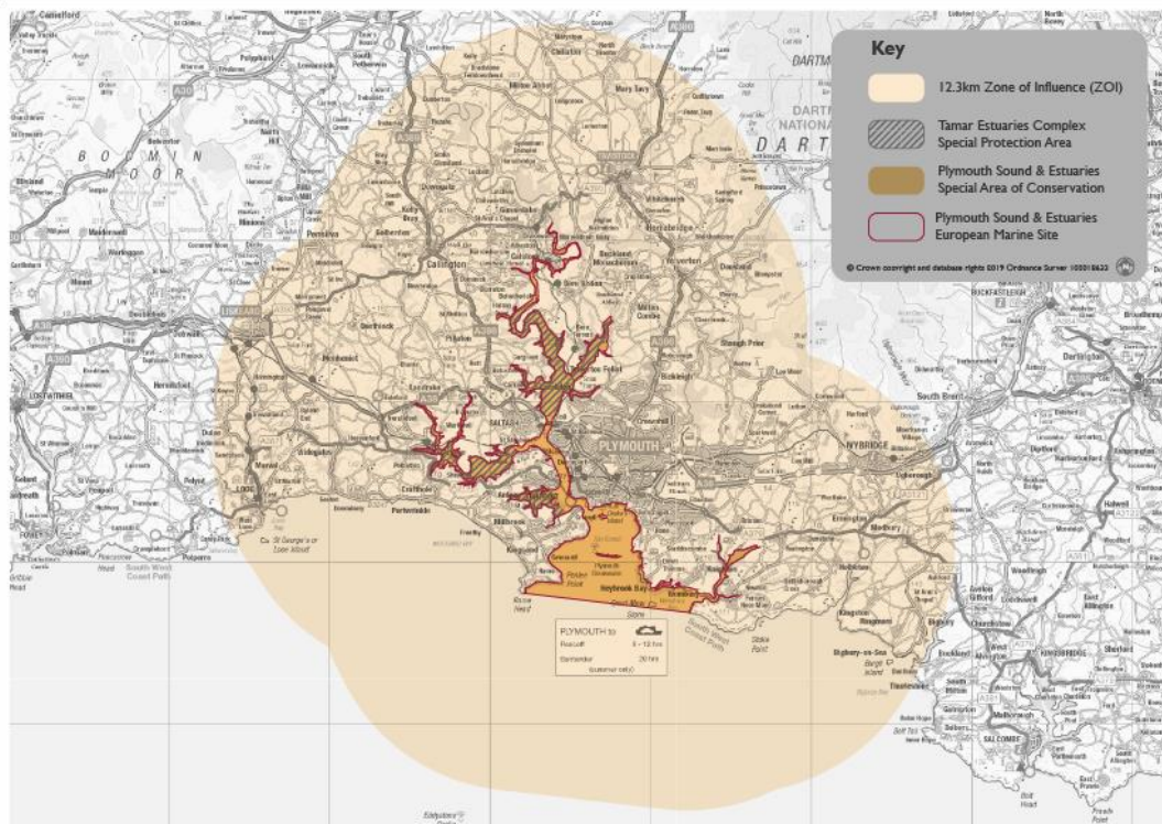
Figure 1: Zone of Charging of 12.3km